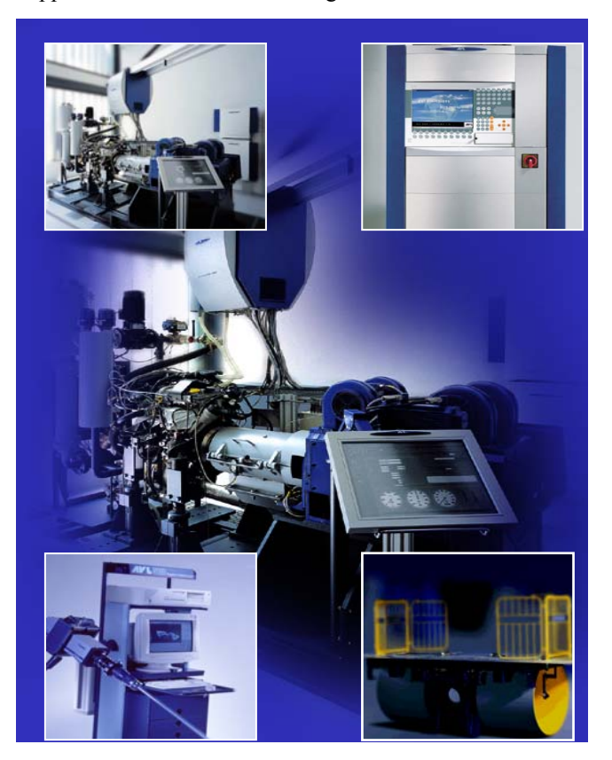
Figure 1: The PUMA Open Instrumentation and Test System for Engines, Transmissions and Power Trains

PUMA Open is an automation system (AS) (Figure 1) for the development and test of engines, transmissions and power trains. PUMA Open has been designed as an open platform in the sense that it is based on standardized interfaces for data acquisition and communication as well as modular hardware and software components. This supports the extension and configuration of the AS.