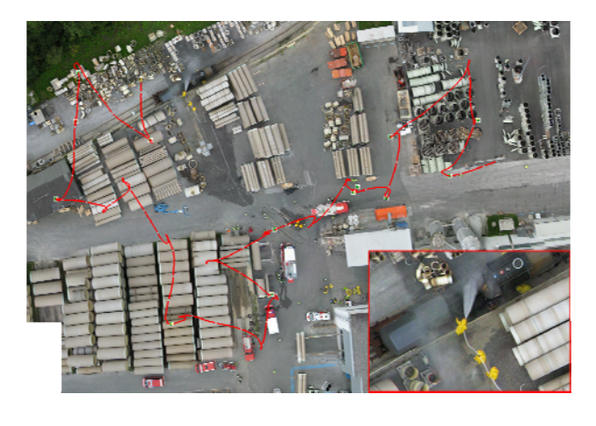
Figure 3. Overview image computed from a set of 40 pictures