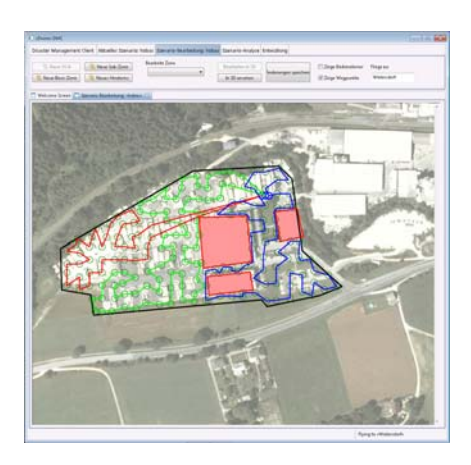
Figure 2. Observation area, forbidden areas, and planned route

First of all, the operator had to specify the scenario. Figure 2 illustrates the scenario of the firefighter service drill in Wietersdorf. We specified the whole area of the exercise as the observation area, so that the officers in charge could monitor the movements of the firefighters. The buildings in the area were marked as obstacles because those were not of interest in this case. Specifying the scenario with the observation area, forbidden areas, allowed altitudes, and available resources took less than 2 minutes.